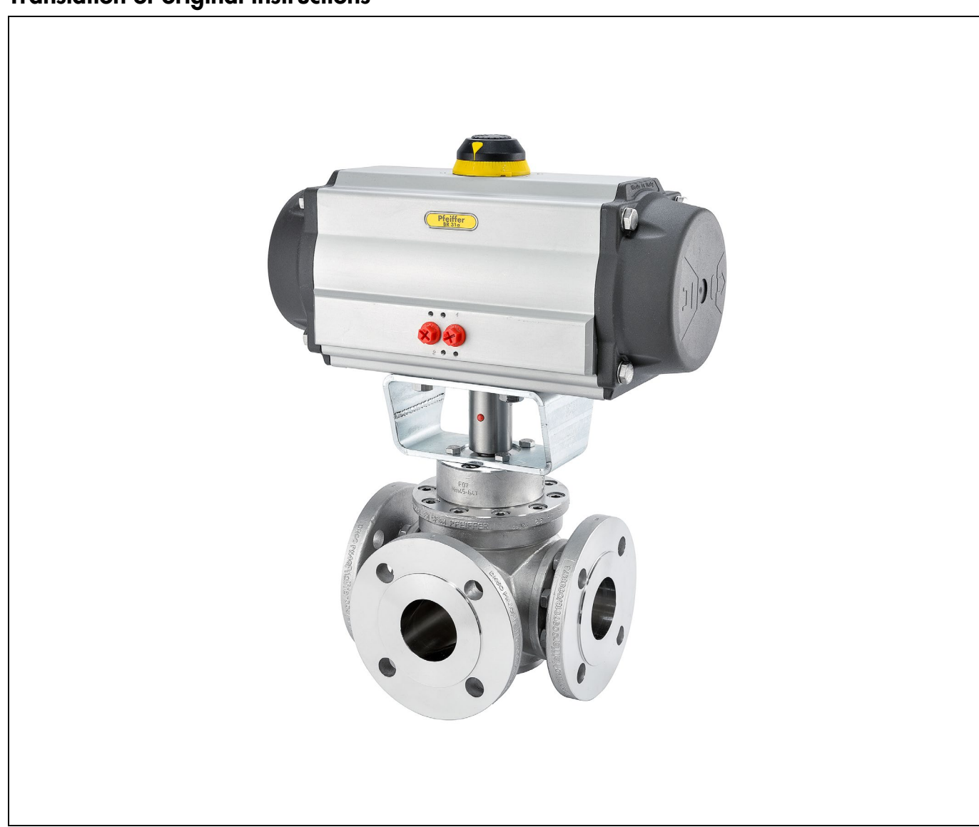
BR 28t Piggable 3-Way Ball Valve